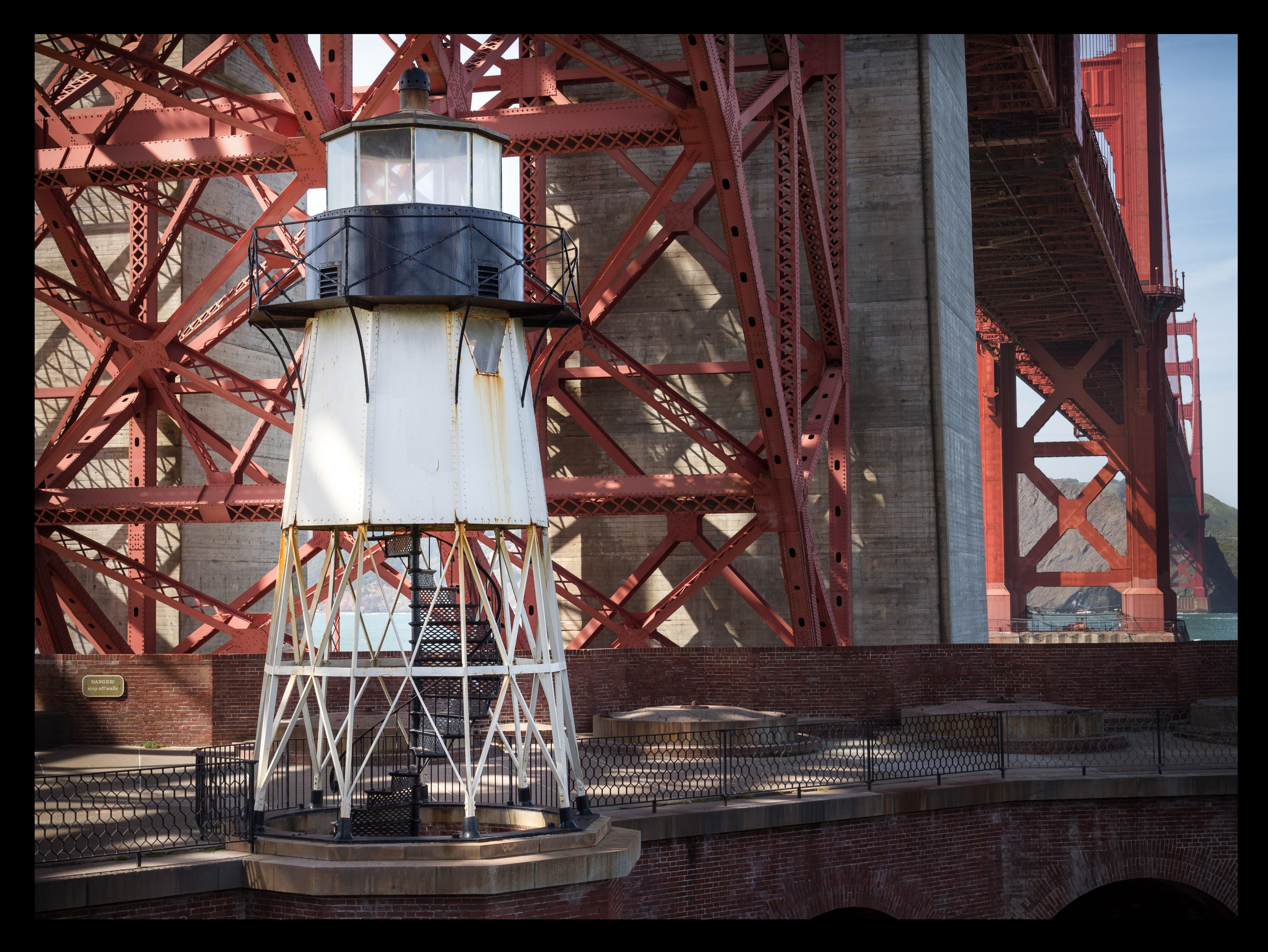
FORT POINT LIGHTHOUSE