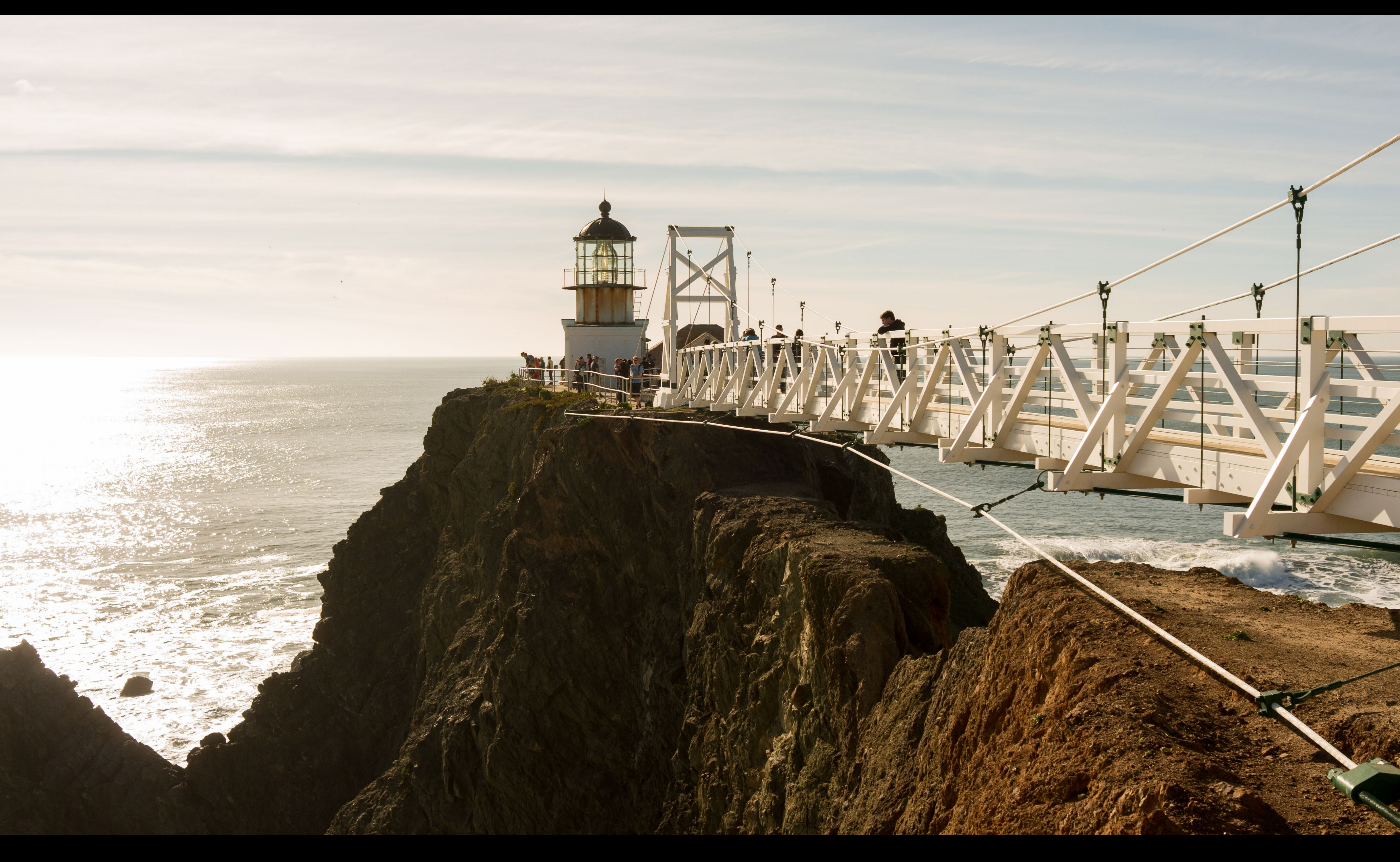
POINT BONITA LIGHTHOUSE