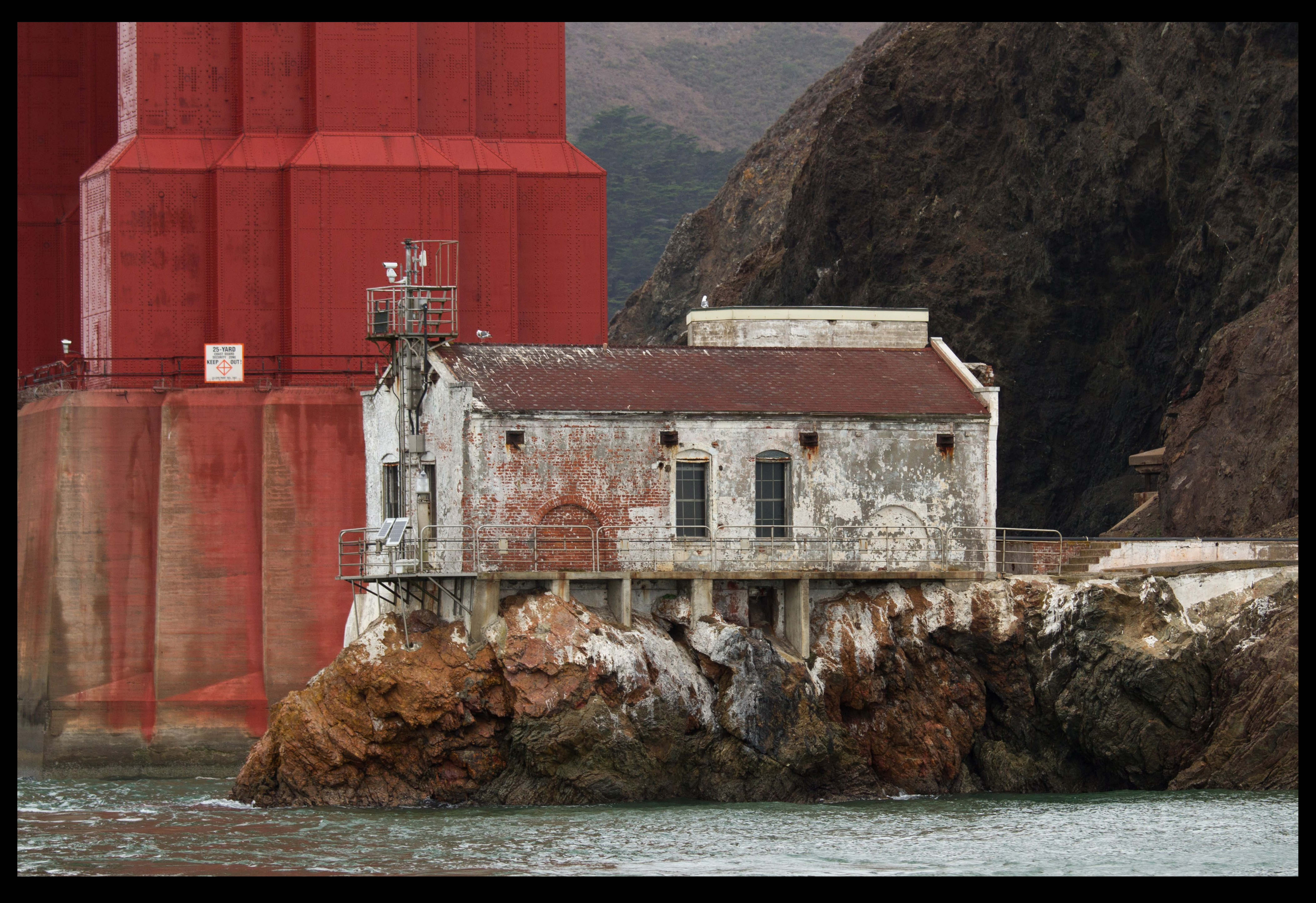
LIME POINT LIGHT STATION